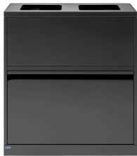
Bica Model 880 Waste sorting 80 ltr. Up to 11 fractions

Bica waste sorting is a durable solution created for everyday use. Developed for the large office, the classroom, theater or shopping centre. Waste sorting must be easy to use. Bica inner bins allow further division of waste. Our waste solutions are available in black and anthracite as standard with smooth surfaces for easy cleaning.