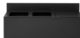
Bica Model 911 Waste sorting 3x20 ltr.