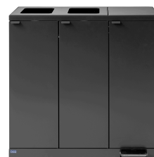
Bica Model 973 Waste sorting 3x65 ltr.