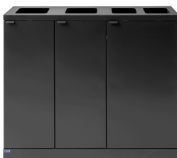
Bica Model 950 Waste sorting 2x65 + 2x45 ltr.