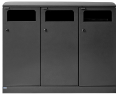
Bica Model 713 Waste sorting 3x100 ltr.

Makes it easy to sort waste in all outdoor areas. Both in parks, in urban spaces, shopping streets and in outdoor areas at the company. With a Bica outdoor recycling bin, the best conditions for sorting are created. The outdoor waste bins are designed in a strong construction with and without an ashtray.