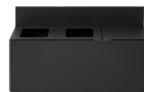
Bica Model 912 Waste sorting 3x15 ltr.