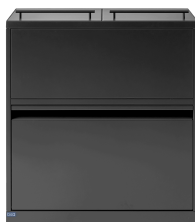
Bica Model 881 Waste sorting 80 ltr. Up to 11 fractions