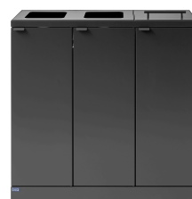
Bica Model 873 Waste sorting 3x65 ltr.