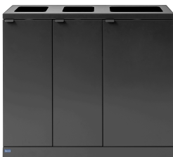
Bica Model 829 Waste sorting 2x65 + 1x95 ltr.

Optimize your business with an effective solution for indoor waste sorting. With Bica recycling bins, waste sorting becomes easier in the office, educational institution, school, airport and at the theatre. Our waste sorting solutions for indoor use are stylish, so they can easily fit into the interior and can be combined as needed.