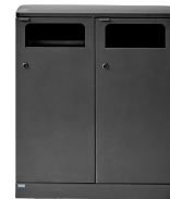
Bica Model 712 Waste sorting 2x100 ltr.